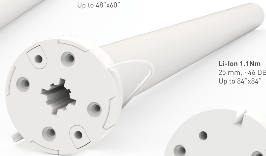
Li-Ion 1.1Nm 25 mm, ~46 DB Up to 84"x84"