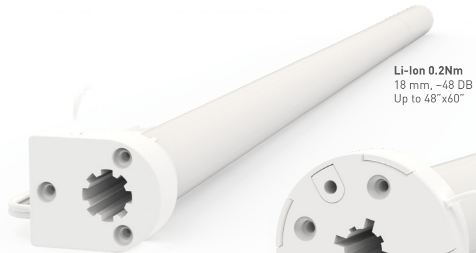
Li-Ion 0.2Nm 18 mm, ~48 DB Up to 48"x60"