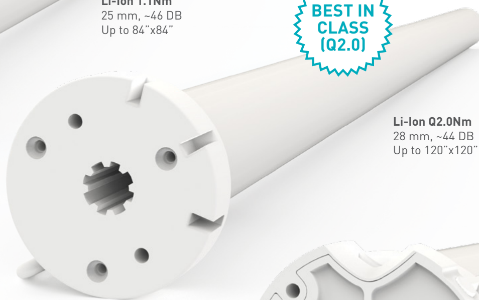
Li-Ion Q2.0Nm 28 mm, ~44 DB Up to 120"x120"